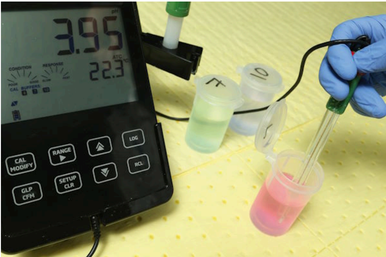
Calibrating a pH meter in order to determine the pH value of materials as required in clause 4.2

In addition to those substances specifically listed in EN ISO 21420, Notified or Approved Bodies may also require evidence of compliance with restricted substances legislation, such as REACH (Regulation (EC) No 1907/2006) Annex XVII. Entry 51 of this legislation restricts the presence of four phthalate plasticisers in articles to a total of less than 0.1 per cent by mass of the plasticised material. Plasticisers are added to increase a polymer's softness and flexibility, and this requirement is particularly relevant for vinyl gloves. The four plasticisers are: i) bis(2-ethylhexyl) phthalate (DHEP), ii) dibutyl phthalate (DBP), iii) benzyl butyl phthalate (BBP), and iv) di-isobutyl phthalate (DIBP).